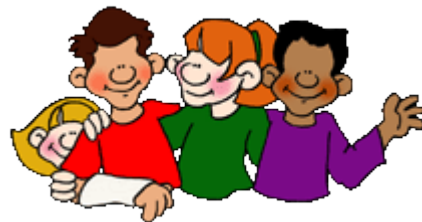
Table Favor Committee

If you are over 80 and would like your birthday listed, contact the church office